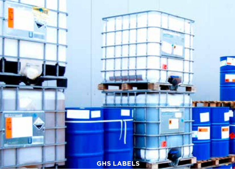
GHS LABELS YUPOFACESTOCK P/S SGM 80