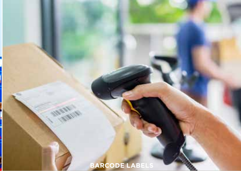
BARCODE LABELS YUPOFACESTOCK P/S SGS 80